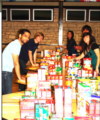
Below- Volunteers from the UT Impact program assemble dinners at Kyle Elementary.